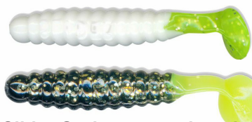
The Slider Grubs we used on the trip.